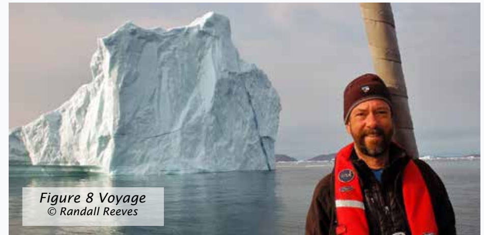
Figure 8 Voyage

We bring the spirit of seafaring to our fellowship by always being willing to assist any sailor we meet, either afloat or ashore.