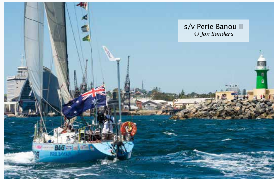
s/v Perie Banou II